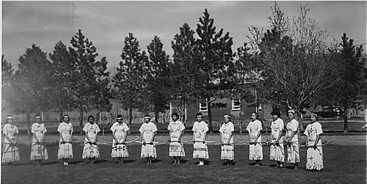
Opened in 1891 and continues to operate as an off-reservation boarding school to this day. Pierre, SD